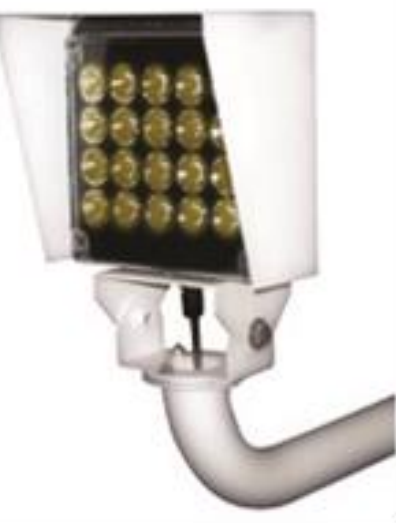
Figure 4: Long Range Strobe Light by Metaphase

These 2D, ALPR systems use an array-type, closed circuit television (CCTV) to acquire vehicle images from one or more lanes of traffic. These systems are able to read the text from vehicle license plates and in some cases take a picture of the driver of the vehicle. This data is used for