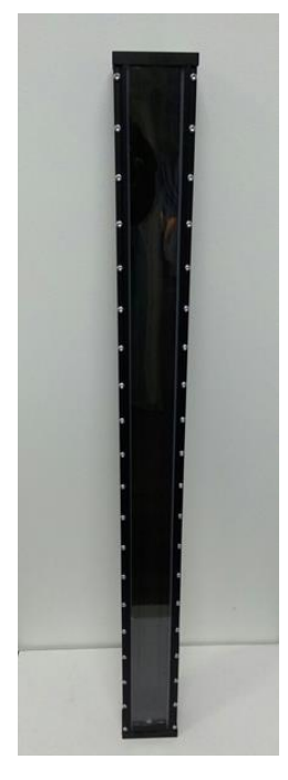
Figure 5: AUVIS Linear Light Source by Metaphase

One application that uses a 1D (line scan) camera and linear light source to generate 3D images is the Automatic Under Vehicle Inspection System, or "AUVIS". As a vehicle (automobile, tractor, trailer or rail car) passes over the AUVIS, a structured line light is projected onto the undercarriage. The ability to manufacture LED fixtures in a rugged, compact, modular form factor allows these systems to be portable or even permanently embedded in a road or track. An AUVIS require a high degree of illumination repeatability and the lighting system must also be able to withstand extreme weather conditions. Line scan cameras coupled with Linear