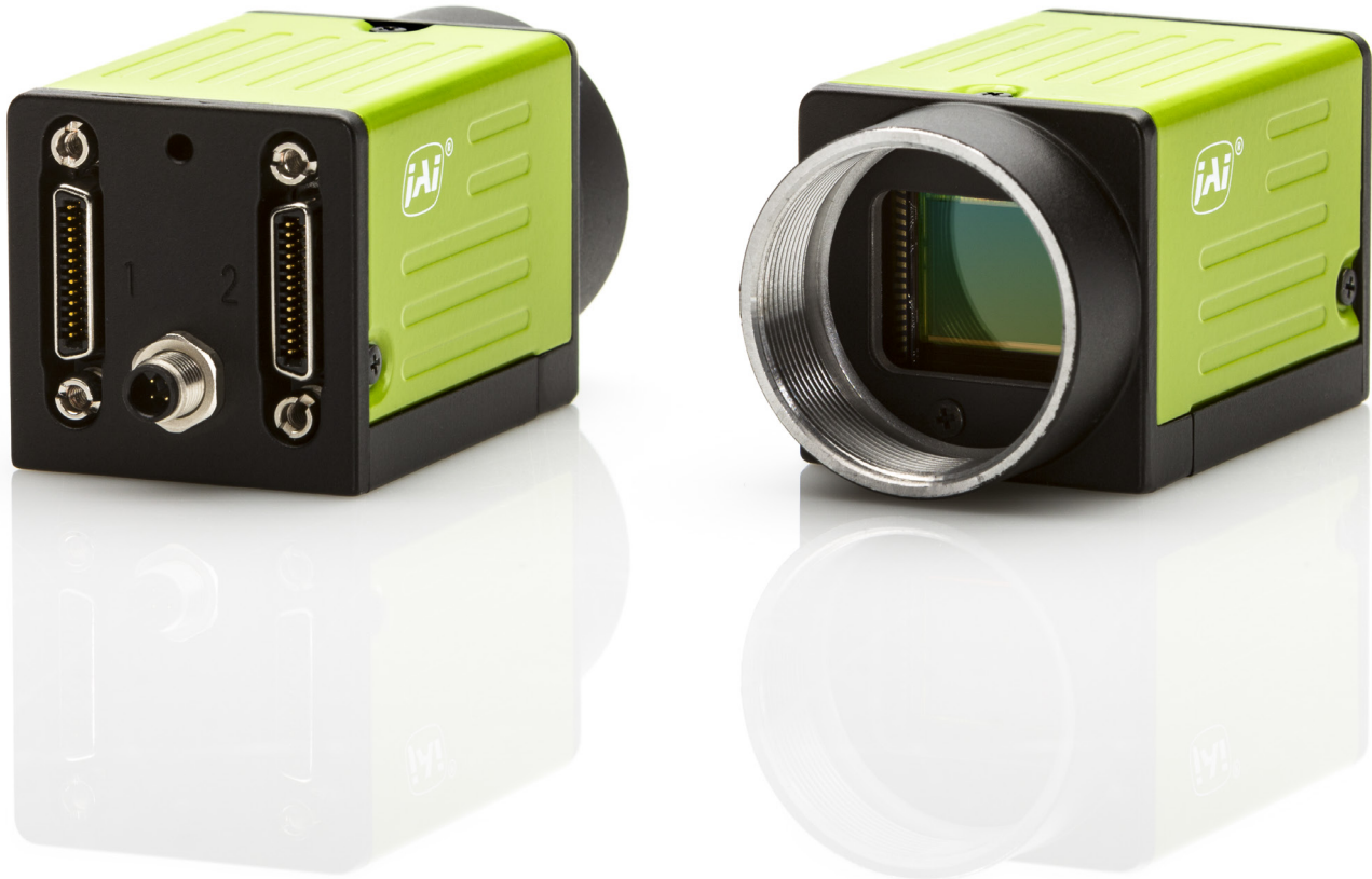
(GO-5000M-PMCL-EP-1 model shown)